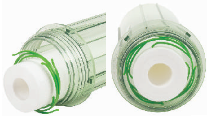
Filter Housing with Centralizing Ring. Filter cartridge is stabilized in the center of the housing.

Reduces the risk of damage to the cartridge and housing elements at installation.