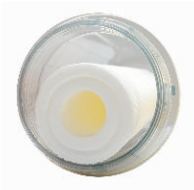
Filter Housing without Centralizing Ring. Filter cartridge falls to the side, unsupported.

Antibacterial and Antimicrobial Filter Cartridge Centralizing Ring